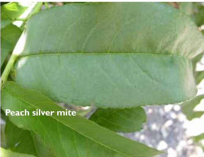
Peach silver mite