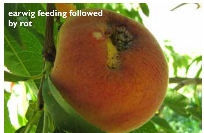
earwig feeding followed by rot