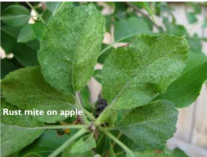
Rust mite on apple

These mites overwinter in the host trees' bud scales. In spring, females feed on developing leaves and blister mites lay their eggs within the blisters. The mites feed within the blisters for protection, but are able to move from one to another. There are several generations over the summer. Before leaf fall, eriophyid mites migrate to buds for the winter.