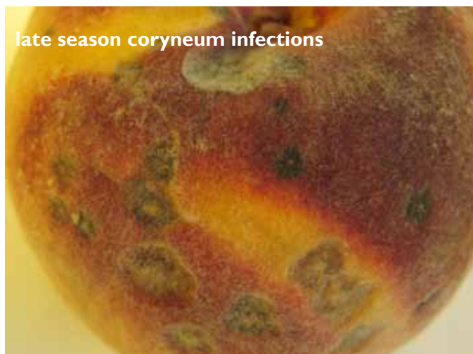
late season coryneum infections

During harvest, you will see many types of injury on peaches. Some can be explained while others (mostly caused by environmental factors) are more difficult to discern. Some of the examples below are the more common types of damage that can be found on ripening peach and nectarine fruit.