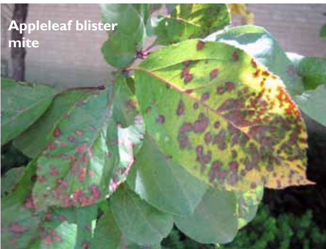
Apple leaf blister mite